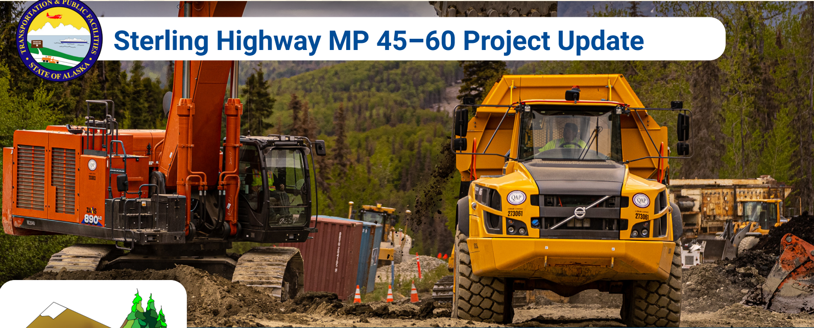
Langille Road construction activities.

The purpose of this monthly report is to provide a snapshot update of the project. For more detailed project information, please visit www.sterlinghighway.net .